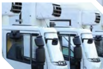
Refrigerating units of transport vehicle