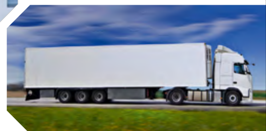
Transport equipment under controlled temperature